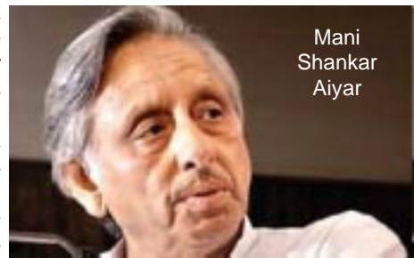
Mani Shankar Aiyar

Again at no point of time in the history of electioneering anywhere in the world had there been such a massive